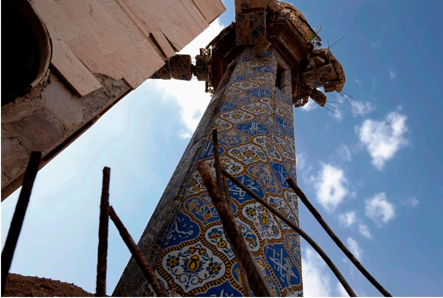
Figure 9.2 The minaret of the Sufi shrine of Sheikh Khaznawi, destroyed by ISIS militants in Tel Marouf, Syria.

accompanying the destruction of people and communities through physical genocide as defined in international law. 14 These attacks were so effective because they were embedded in a well-integrated system that combined religious ideology, a political agenda, extreme violence, and sophisticated propaganda—all amplified at a global scale to reach multiple, targeted audiences through Internet videos, digital magazines, and other social media. Nonhierarchical channels of Internet communication make these messages extremely difficult to counter or suppress.