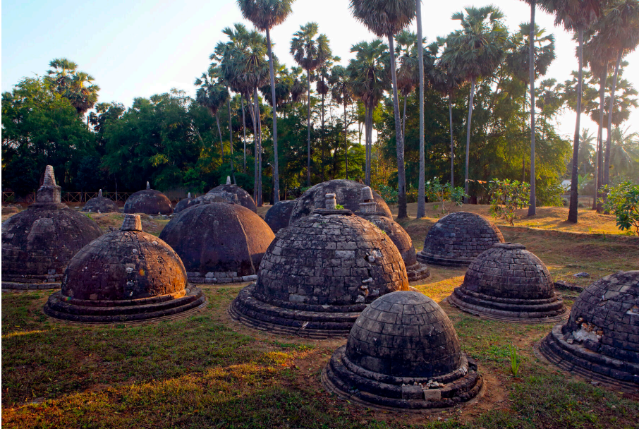
Figure 8.2 Kandarodai site

and coins from the classical Sinhala kingdoms that date to at least eight hundred years after the earliest layers at the site. “This temple,” the signboard says, assuming that there was such a structure there, “was destroyed by the Dravida (south Indian) king Sangili who ruled in the 16th century.” 5 Subliminally, the history of a sixteenth-century conquest of the north by a Tamil monarch is conflated with the insurgency of the LTTE, whose territory this once was, making the Tamils perpetually disruptive outsiders, and making the current Sri Lankan government and Buddhist monastic orders the joint agents in whose pastoral care the land’s original identity is finally being safeguarded (fig. 8.2).