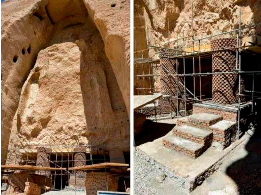
Figure 8.3 Supporting pillars for the eastern Buddha, left, with detail at right

city center of Warsaw are examples of where the act of faithful rebuilding has been lauded rather than criticized.